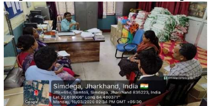
Simdega, Jharkhand, India Jf9j+65v, Samtoli, Simdega, Jharkhand 835223, India Lat 22.619006° Long 84.480371° Monday, 16/03/2026 02:34 PM GMT +05:30

Meeting of Heads of the Departments with the Vice Principal.