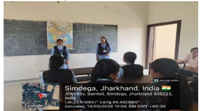
Simdega, Jharkhand, India Jf9j+65v, Samtoli, Simdega, Jharkhand 835223, India Lat 22.618847° Long 84.480069° Saturday, 14/03/2026 10:56 AM GMT +05:30

A Skill Boosting Program was conducted to develop students' skills and learning abilities.