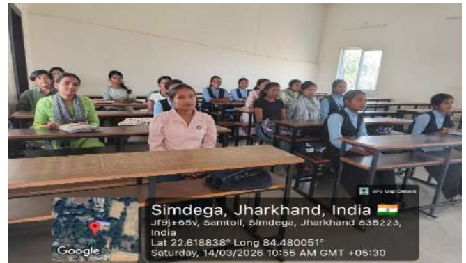
Simdega, Jharkhand, India Jf9j+65v, Samtoli, Simdega, Jharkhand 835223, India Lat 22.618838° Long 84.480051° Saturday, 14/03/2026 10:55 AM GMT +05:30