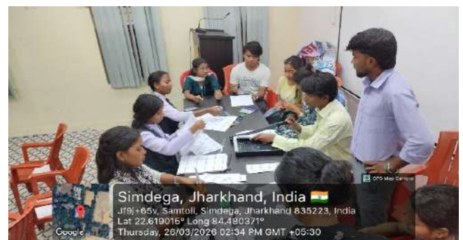
Simdega, Jharkhand, India Jf9j+65v, Samtoli, Simdega, Jharkhand 835223, India Lat 22.619016° Long 84.480371° Thursday, 26/03/2026 02:34 PM GMT +05:30

Students are working for the smooth conduct of the Student Council Election.