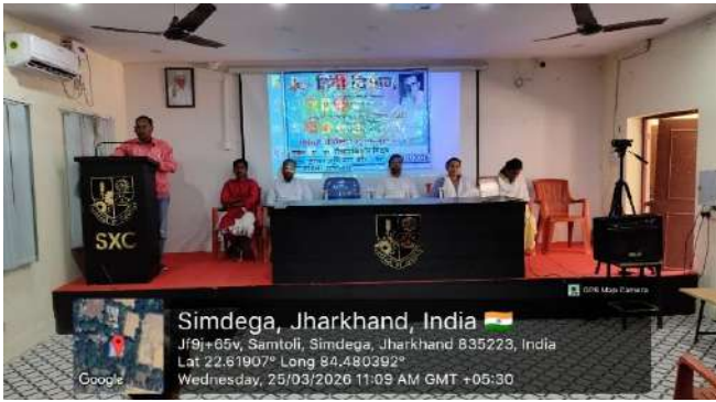
Simdega, Jharkhand, India Jf9j+65v, Samtoli, Simdega, Jharkhand 835223, India Lat 22.61907° Long 84.480292° Wednesday, 25/03/2026 11:09 AM GMT +05:30