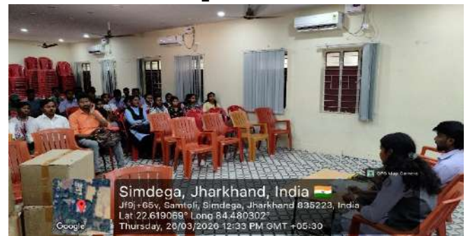
Simdega, Jharkhand, India Jf9j+65v, Samtoli, Simdega, Jharkhand 835223, India Lat 22.619089° Long 84.480302° Thursday, 26/03/2026 12:33 PM GMT +05:30

The student council meeting with the class representatives