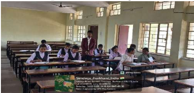
Simdega, Jharkhand, India Sikidaga Block, Seraikela-Chandernagar, Jharkhand 836273, India Call: 22.619006° Long: 84.480371° Saturday, 14/03/2026 10:16 AM GMT+05:30 Note: Captured by GPS Map Camera

A sketching activity was organized to nurture creativity and artistic expression among students.